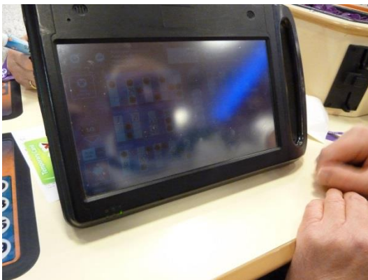
Figure 9: Max tablet screen dimmed