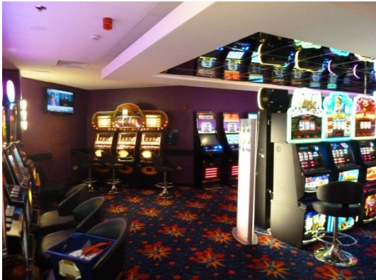
Figure 1: Slot machine room