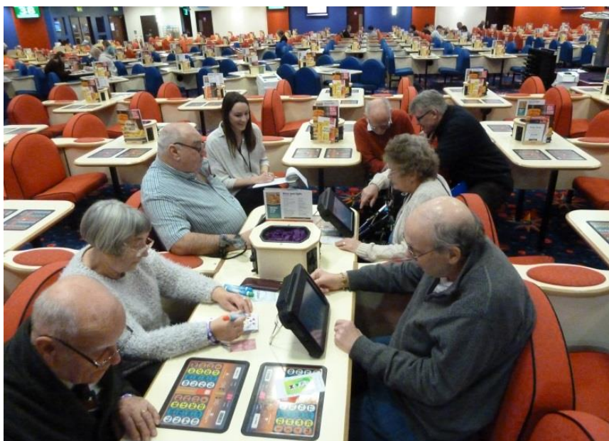
Figure 7: Participants playing the bingo game

Participants found the second bingo game easier to follow as they understood the game process and how to use the Max tablets. However all still thought the numbers should be called at a slower pace.