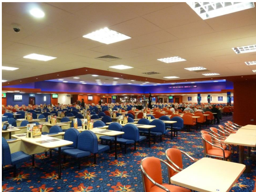
Figure 3: Main bingo hall

Researchers noted that there was no sign in the main bingo hall identifying either the slot machine room or the exit to the main reception.