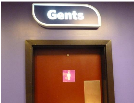
Figure 4: Toilet sign